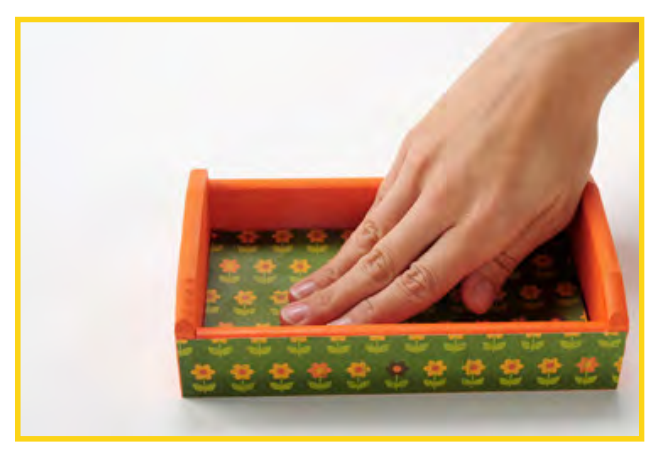
Keep smoothing until all of the bubbles are removed.

Adhere each element with the Mod Podge finish of your choice. Always start with the underlying design elements and work your way upward. Apply a medium coat of Mod Podge to the surface. Too little Mod Podge and you will get wrinkles – you can always wipe away excess Mod Podge. Place your item(s) to be decoupaged on top of the Mod Podge and smooth thoroughly.