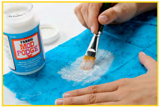
Allow to dry. This will allow you to cut the fabric like paper without frayed edges.

• Fabric - Wash and dry the fabric (do not use fabric softener). Iron and then lay out on a covered work surface. Wax paper is preferable for covering your table. Using a brush, paint a light coat of Fabric Mod Podge onto your fabric.